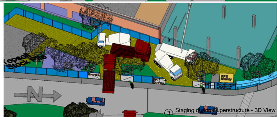
③ Staging during Superstructure - 3D View