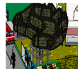
⑤ Tree Protection Enlarged View