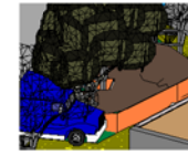
⑥ Silt Fence Enlarged View